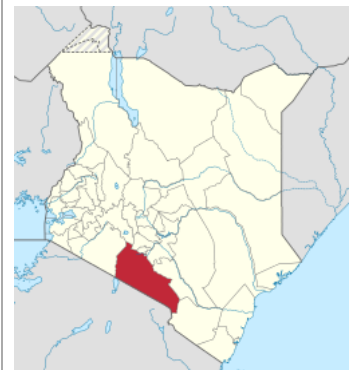
Location in Kenya