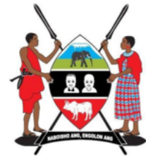
Coat of arms