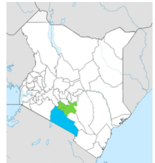
Kajiado County (blue) within Nairobi Metro (green)

Kajiado County is within Greater Nairobi which consists of 4 out of 47 counties in Kenya but the area generates about 60% of the nation's wealth. [2][3] The counties are: