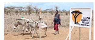
Landscape in Kajiado County